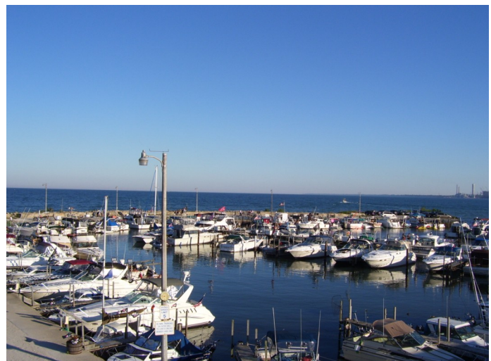
Memories of Summer—September 2007