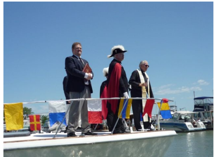
Blessing of the Fleet