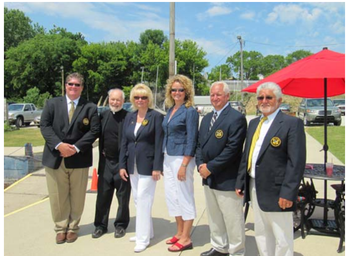
SMYC Officers at the annual blessing of the fleet