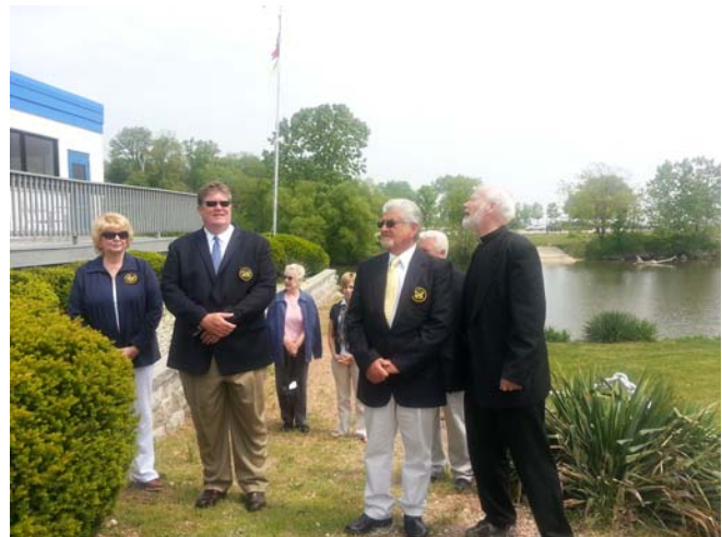
SMYC Officers gather for the raising of the flag at the annual blessing of the fleet event June 9th