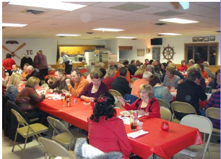
SMYC'ers enjoy Valentines Turduckin