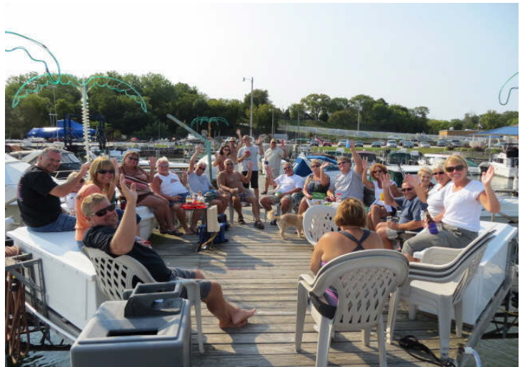
SMYC'ers take in a warm September afternoon down at the club on the gas dock